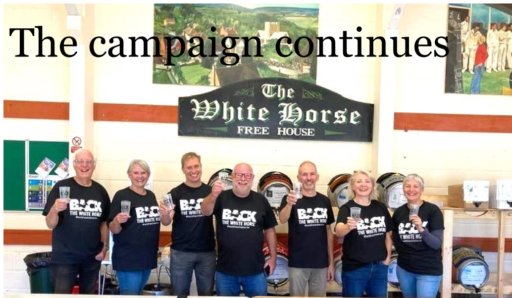
The Back the White Horse committee at October's mini beer festival