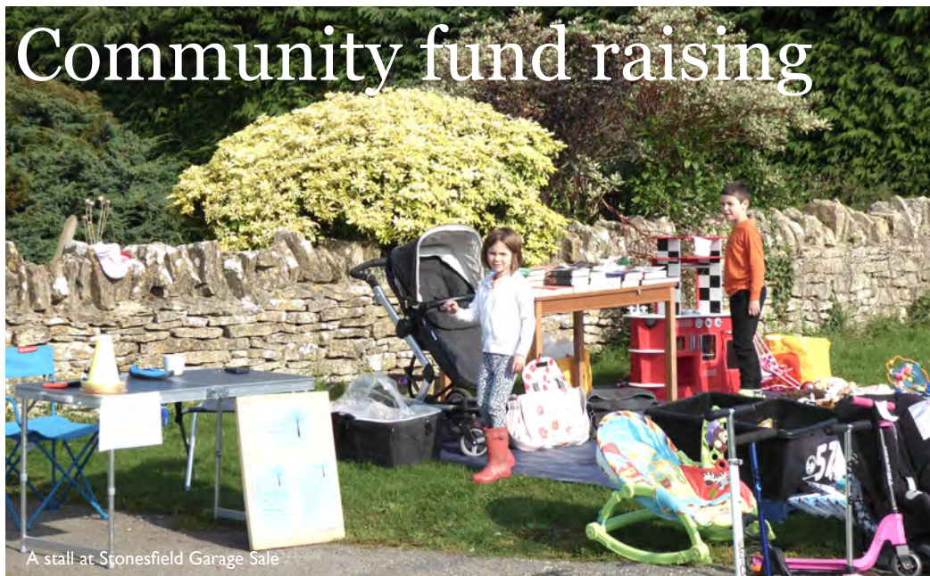
A stall at Stonesfield Garage Sale

Thank you to everyone who supported the Stonesfield Garage Sale on Sunday 20 September.