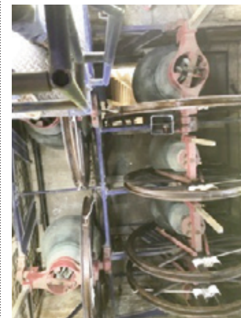
The bells seen from above