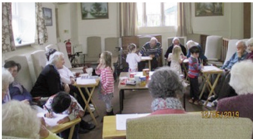
Children from the Pre-School visit members of the Lunch Club (see opposite page)

Robert Courts MP, Member of Parliament for Witney & West Oxfordshire (Tel: 01993 225020; robert@robertcourts.co.uk ; website: www.robertcourts.co.uk )