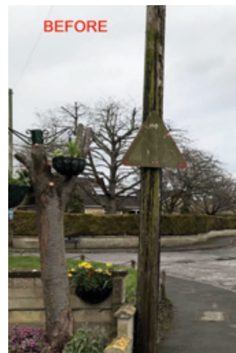
A roadsign cleaned by SAFER volunteers (see p.5)

For more details please contact Brian Clarke (8917700).